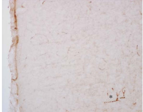
Fig 2b: Absence of specific immunohistochemical staining with McAB 6B3 in the cerebral cortex of a calretinin knock-out mouse (5). Non-specific staining of the vessel walls (asterisk) due to the anti-mouse secondary antibody. X 100